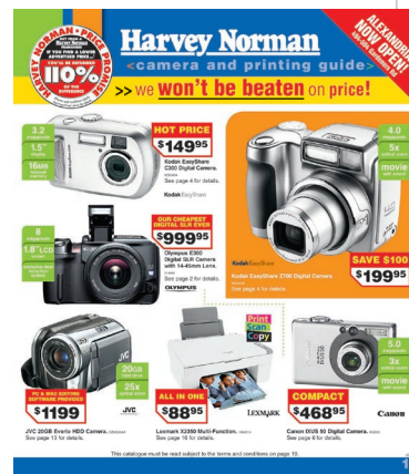
leaflets and catalogues